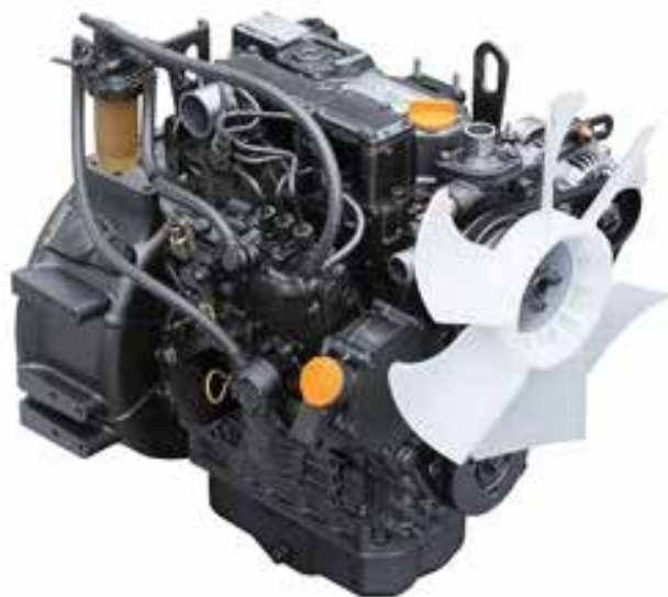
Yanmar 3TNV76 Industrial Engine