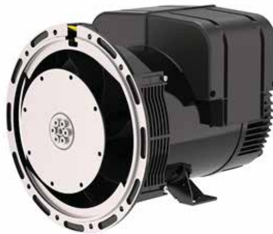
Leroy Somer TAL Range Alternator